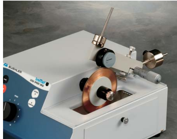
Mounted samples can be sectioned effectively with proper selection of chucks and flanges.