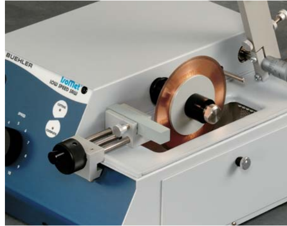
The optional dressing chuck (No. 11-1196) allows dressing of the wafering blade without interrupting the sectioning process.